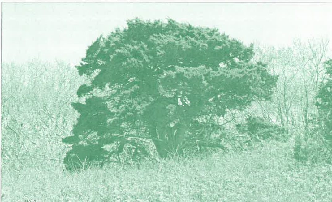
This tree on the BCT Lawrence Island property was the inspiration for the BCT symbol.

The BCT’s approach has been successful because our preserved woodlands, shore frontages, marshes, and trails speak for themselves and because we have a constituency that understands the value of open space and understands that it is everyone’s responsibility.