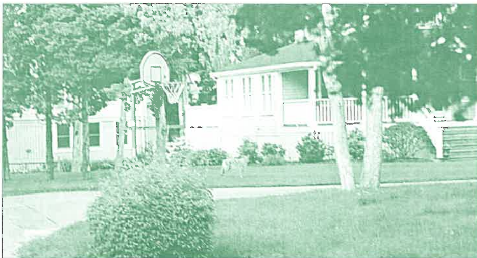
An Eastern Coyote has been a regular visitor to this Pocasset neighborhood since April.